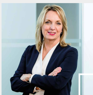
p.10 GROUP CEO'S REVIEW