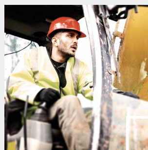
p.20 STRATEGY IN ACTION